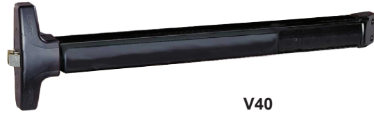
V40 (711 Finish)

Wide Stile shown, for Narrow Stile, specify NS Option (for use on 36" and 48" doors with 2" stiles).