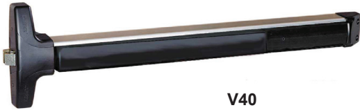
V40 (628 Finish)

The V40 Series rim exit device is secure and durable panic and fire exit hardware at an economical price. It is designed for use on all types of single and double doors with mullions. The patented mounting plate and strike locator system ensures the easiest and most accurate installation of panic hardware available.